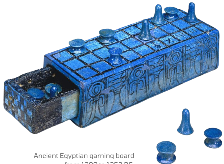
Ancient Egyptian gaming board from 1390 to 1353 BC.