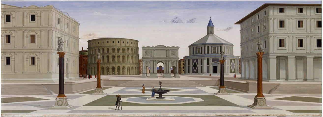
The Ideal City (probably by Fra Carnevale, c. 1480–1484)